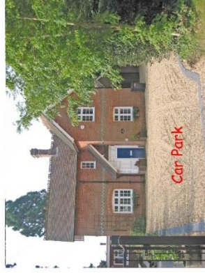
WI House Mortimer