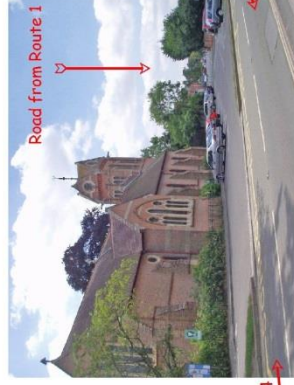
St John's Church Mortimer